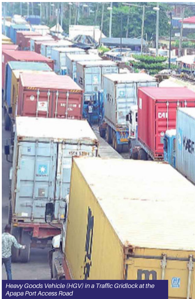
Heavy Goods Vehicle (HGV) in a Traffic Gridlock at the Apapa Port Access Road

technical training support to the Complaints Unit, and facilitate collaboration between NSC Cargo/Vessel Clearance Officials, Logistics Officials, and representatives from NAGAFF, CRFFN, and other bodies to determine the common challenges faced and strengthen their capacity to address such challenges. The committee also implored the ICPC to serve as a "champion" by engaging and encouraging all port agencies to make compliance to SOPs a priority.