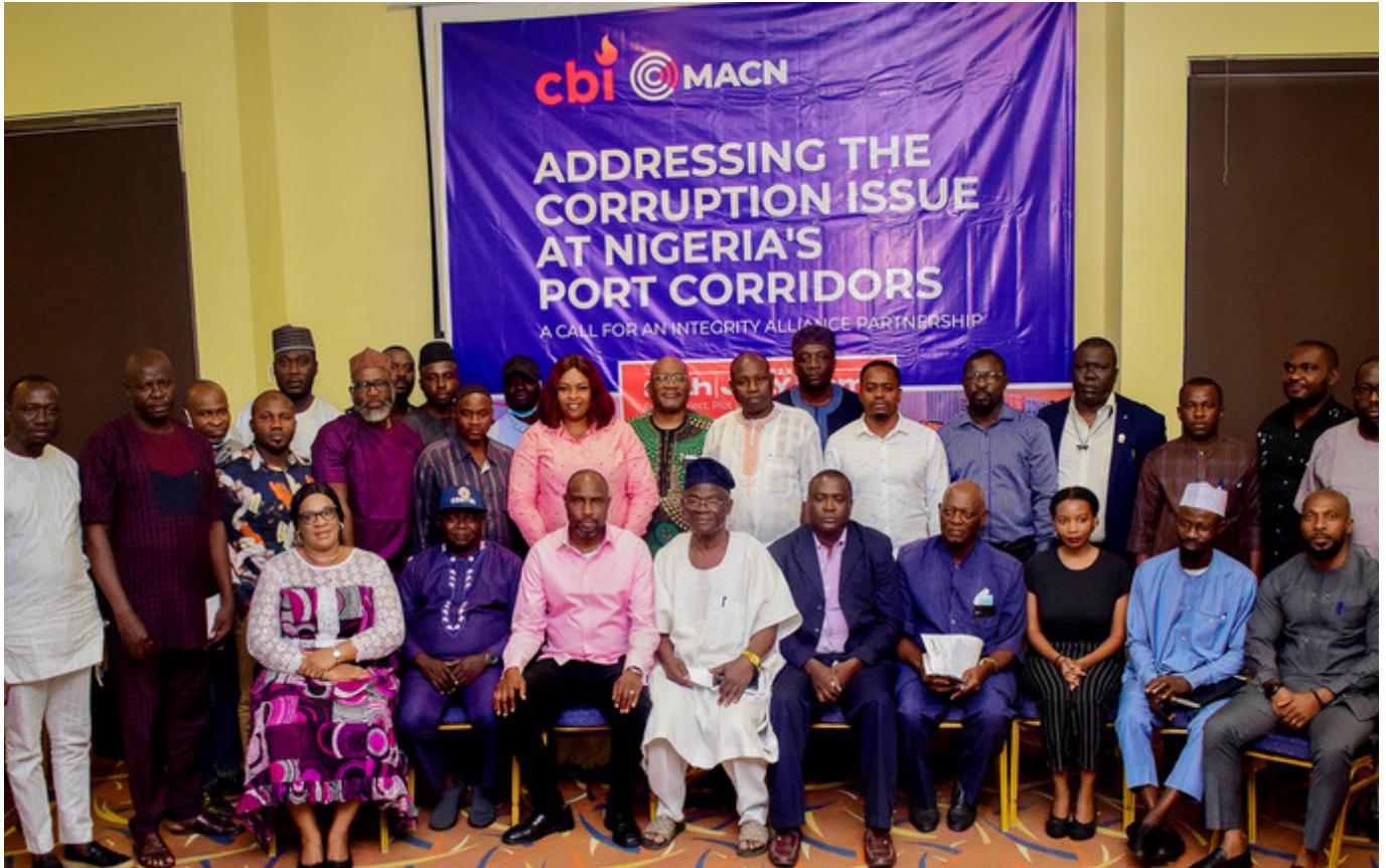
Key Stakeholders at the Truckers' Associations Conference

On July 20th, 2022, members of the maritime trucking and haulage industry gathered for a conference titled "Addressing the Corruption Issue at Nigeria's Port Corridors: A Call for an Integrity Alliance Partnership." The event, hosted by MACN/CBi, featured four technical sessions that explored the challenges faced along the port corridors, the need for data and statistical evidence to get more detailed insight into the problem, the tools available to truckers for addressing obstacles, and the strength of using a collective voice to obtain true reform.